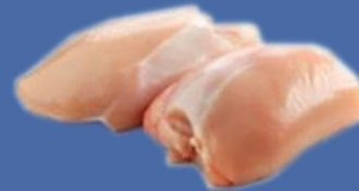
Viande de cuisse Leg Meat