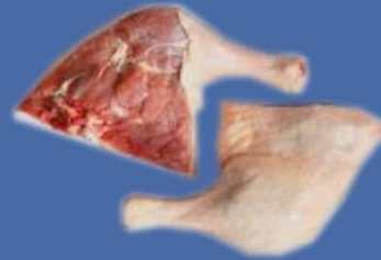
Cuisses Leg Quarters