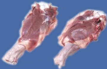
Manchons Prime Wings