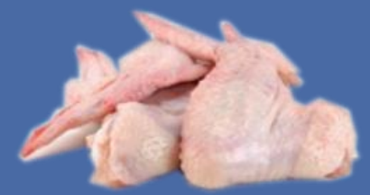
Ailes 3 phalanges 3 Joints Wings