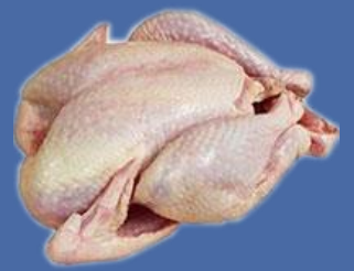
Dindes entières Whole Turkeys