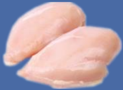
Filets Breast Fillets