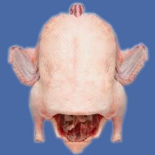
Canards Entiers Whole Ducks