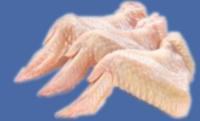
Ailes 3 phalanges 3 Joints Wings