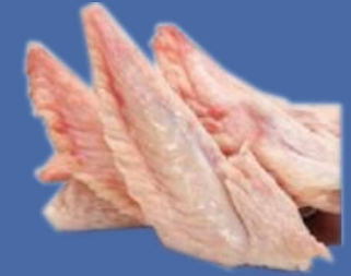
Pointes d'ailes Wing Tips