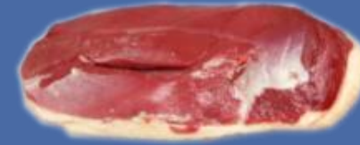
Magrets Duck Breasts