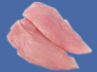
Filets Breast Fillets