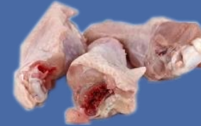
Blanquettes Prime Wings