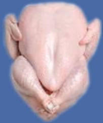
Poulets Entiers Whole Chickens