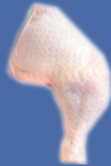
Cuisses Leg Quarters