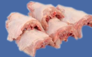
Dos Upper Backs